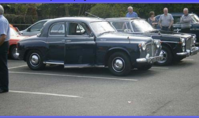
Some of the cars at the start