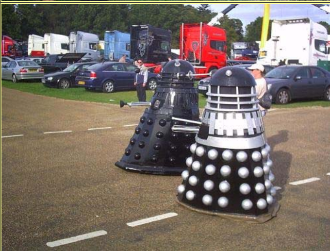
Back to 2009 Index