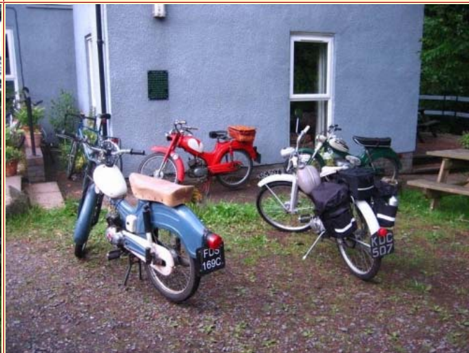
Peds at the ready