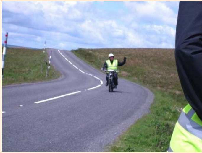
Down into Teesdale