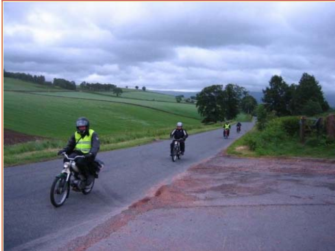
Somewhere in the North Lakes