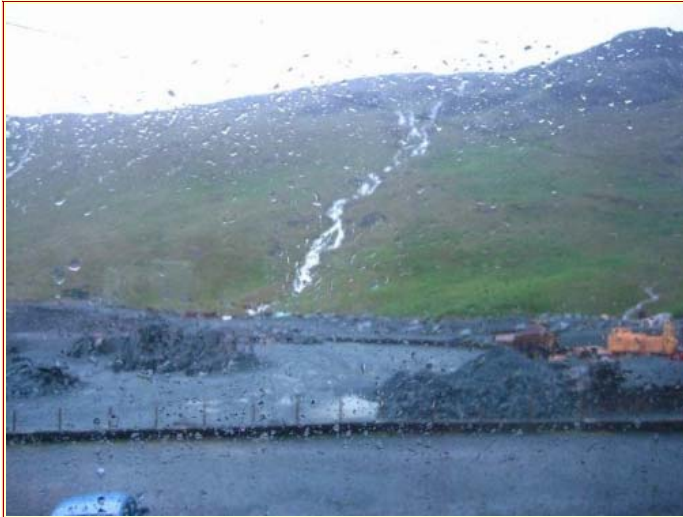
From Honister Hostel