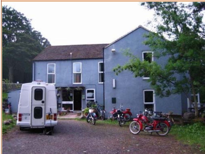
The Alston Hostel