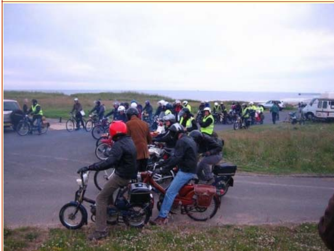
The start at Crimdon Dene