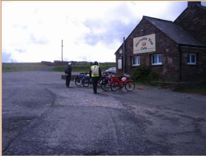
What is says on the sign