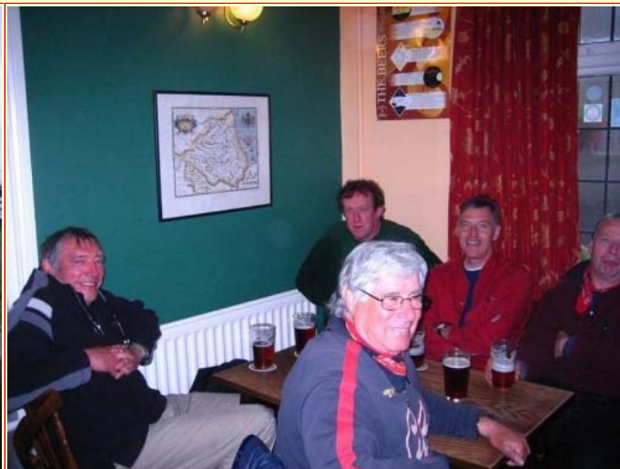
Dinner in Alston