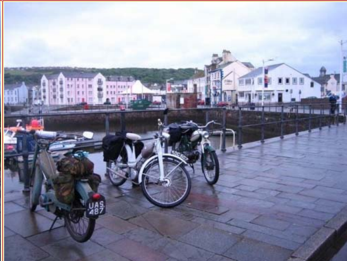
The Quay at Whitehaven