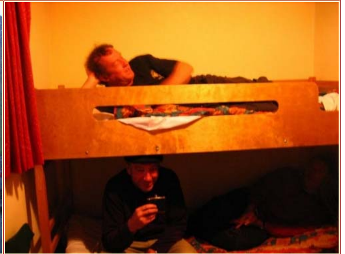
A dram before bed