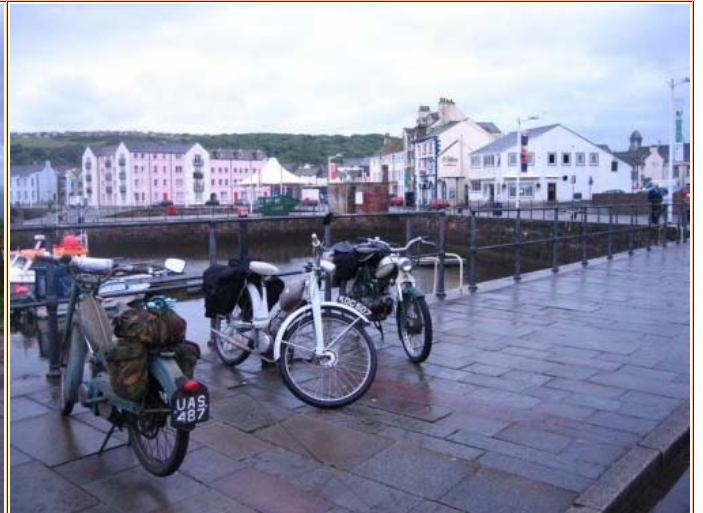
The Quay at Whitehaven