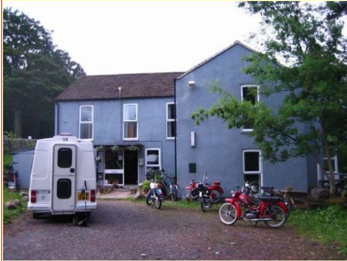
The Alston Hostel