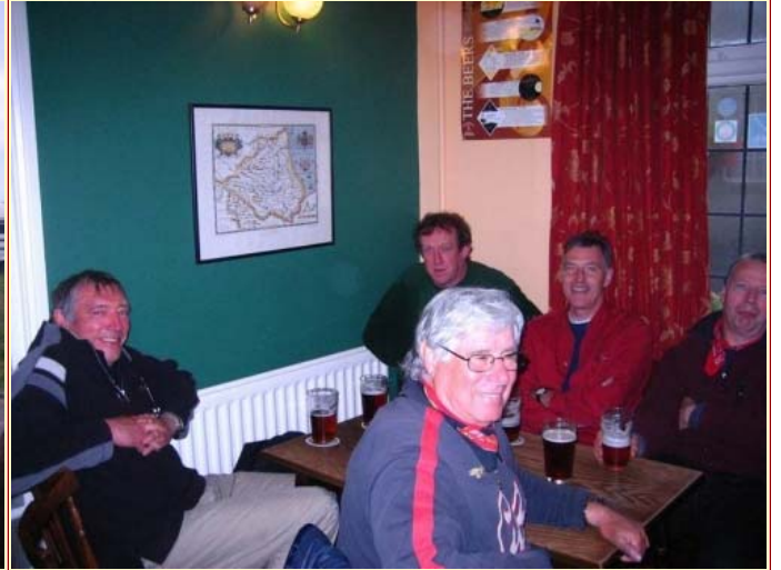
Dinner in Alston