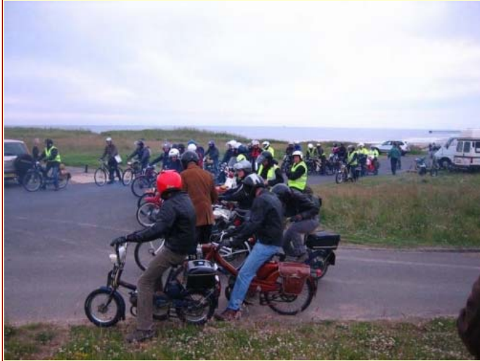
The start at Crimdon Dene