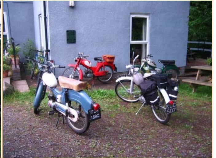
Peds at the ready